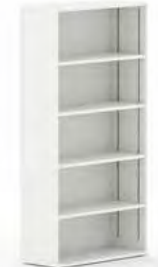
Bookcase ASSU20 - 4 Shelves supplied