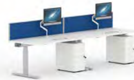
2 person desk - In-line

Fabric Screens FBUSHA0616 Monitor Arm MON1 Pedestal CONMP