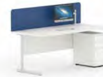
Rectangular Desk - Cantilever