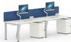
2 person desk - In-line

Fabric Screens FBFU16 Monitor Arm MON1 Pedestal CONMP