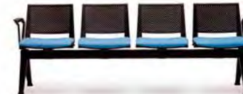
4 Unit seat PLU-SSSS - 4 unit seat PLU-ASSSSA - With arms