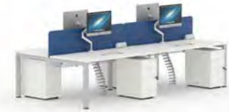
4 person bench - Back to back

Fabric Screens FBFU16 Monitor Arm MON1 Pedestal CONMP