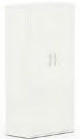
Double door cupboard ASDR20 - 1 Shelf supplied