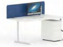
Single Wave Desk - Cantilever