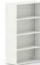
Bookcase ASSU16 - 3 Shelves supplied