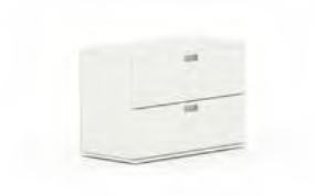
Side filer SF10 - 1000W x 500D x 730H