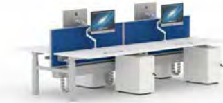
4 person bench - Back to back

Fabric Screens FBUS0416 Monitor Arm MON1 Pedestal CONMP