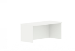
Pedestal storage top PCT8 - 430W x 800D x 425H *Does not include pedestal. To be used with CONDH8 or DH8 only.