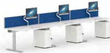
3 person desk - In-line

Fabric Screens FBUSHA0616 Monitor Arm MON1 Pedestal CONMP