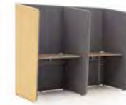
Two person booth FCB02