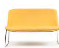
2 Seat sofa HRB60 - Wire frame