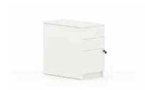
Desk high pedestal CONDH8 - 430W x 800D x 730H