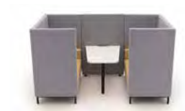
Four seat booth ELG14