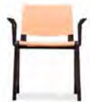
4 Leg frame With arms PL3A - Wood back & seat