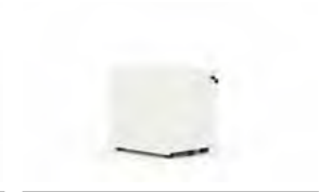
Mobile pedestal ASMP3 - 430W x 575D x 565H