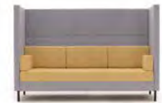
Three seat ELG03