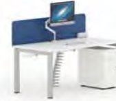
1 person desk - Standalone

MFC Desk FBSC16-1 Cable Basket FBBA16 Cable Spine FBCCM