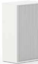
Side opening tambour ASST16 - 1 Shelf supplied