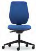
No arms M300 - Standard mechanism