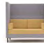
Double seat ELG02