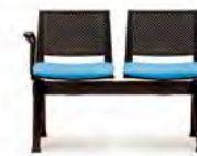
2 Unit seat PLU-SS - No arms PLU-ASSA - With arms