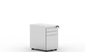
Tall steel mobile METMP - 391W x 565D x 305H