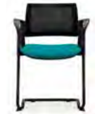
Cantilever frame With arms KM10A - Upholstered seat