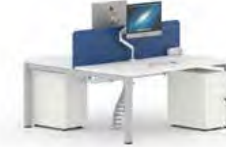
2 person bench - Back to back

Fabric Screens FBFU16 Monitor Arm MON1 Pedestal CONMP