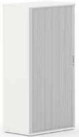
Side opening tambour ASST20 - 1 Shelf supplied