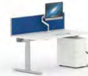
1 person desk - Standalone

Electric Height adjustable in-line and bench