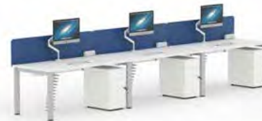
3 person desk - In-line

Fabric Screens FBFU16 Monitor Arm MON1 Pedestal CONMP