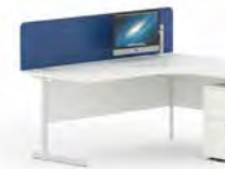
Radial Desk - Cantilever