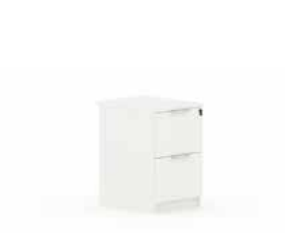
Filing cabinet 2DFC - 474W x 600D x 730H