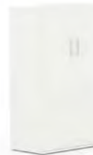
Double door cupboard ASDR16 - 1 Shelf supplied