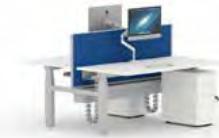
2 person bench - Back to back

Fabric Screens FBUS0416 Monitor Arm MON1 Pedestal CONMP