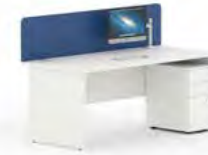
Rectangular Desk - Panel end