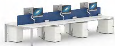
6 person bench - Back to back

Fabric Screens FBFU16 Monitor Arm MON1 Pedestal CONMP