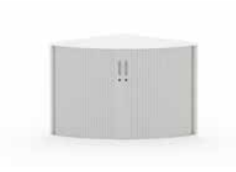
Tambour corner unit CST8 - 800W x 800D x 730H