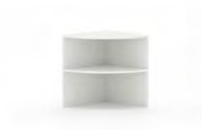
Open corner unit CS6 - 600W x 600D x 730H