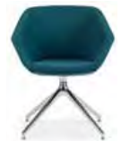
Side chair CLR40 - Pyramid base