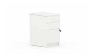
Desk high pedestal CONDH6 - 430W x 600D x 730H