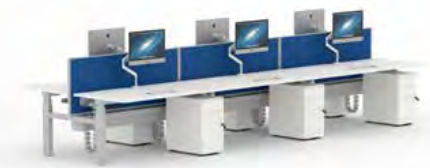
6 person bench - Back to back

Fabric Screens FBUS0416 Monitor Arm MON1 Pedestal CONMP