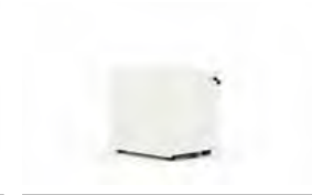
Mobile pedestal ASMP2 - 430W x 575D x 565H