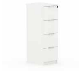
Filing cabinet 4DFC - 474W x 600D x 1365H