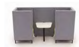
Two seat booth ELG12