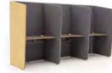
Three person booth FCB03