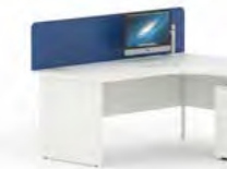
Radial Desk - Panel end