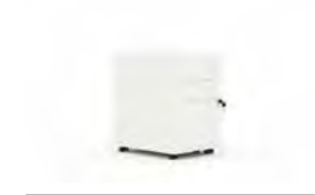
Mobile pedestal CONMP - 430W x 575D x 631H