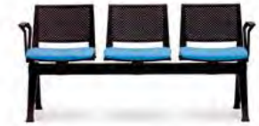
3 Unit seat PLU-SSS - No arms PLU-ASSSA - With arms