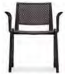
4 Leg frame With arms PL1A - Plastic back & seat