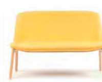
2 Seat sofa HRB70 - 4 Leg solid Ash frame