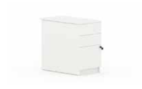
Desk high pedestal CONDH8 - 430W x 800D x 730H